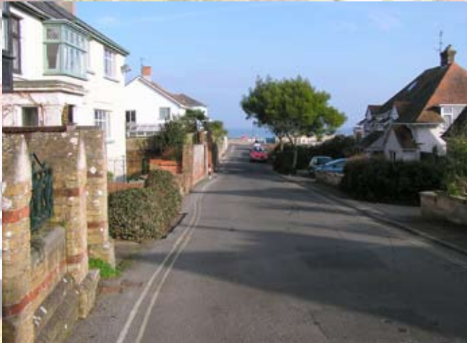
Above: Oakhill Road from Oaks (left) looking towards the sea. Overleaf background: Nearby is beautiful Priory Bay.

The adjoining Red House can be booked together with Oaks for larger parties of up to 10. A lockable back garden gate near the houses provides access between the two properties.