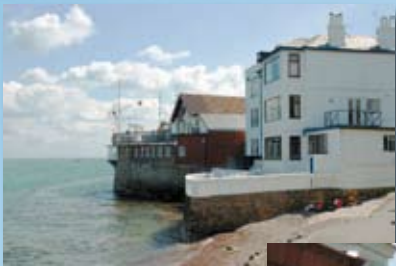
Above: The Sailing Club.