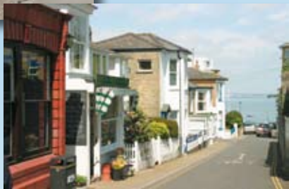
Right: The High Street.

Seaview is a village of unspoilt charm with safe, sandy beaches. It is a place for swimming, sailing and walking along the bay. Above all it is a totally relaxing and enjoyable sanctuary from mainland bustle, at any time throughout the year.